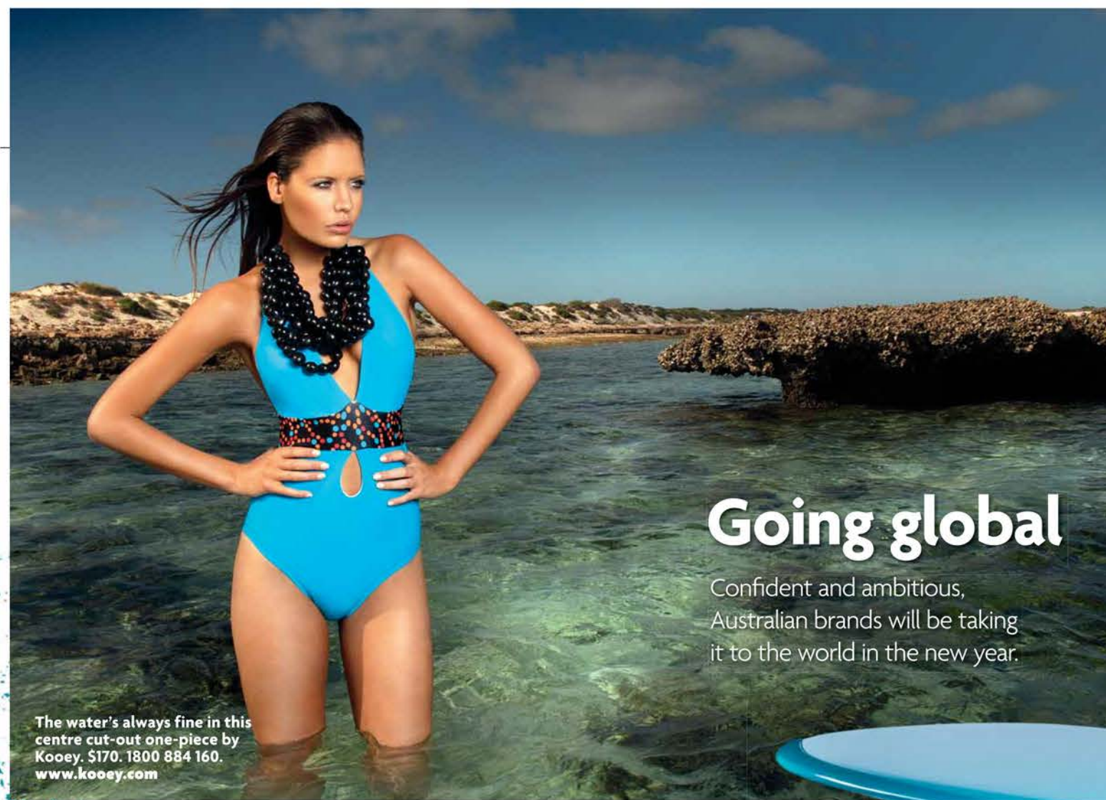
The water's always fine in this centre cut-out one-piece by Kooley. $170. 1800 884 160. www.kooley.com

Remain in the shade with the Black Akubra Outback hat from RM Williams, $155. www.rmwilliams.com.au "It's easy to lust after this dust," says Napoleon Perdis of his Loose Dust Eye Shadows. $35 (The Life Aquatic, below). www.napoleonperdis.com