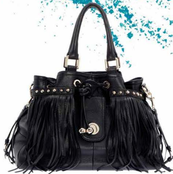
↑ Oroton's Lido Tassel tote is one of many styles in the Australian brand's New Latin summer collection. $895. www.orothon.com