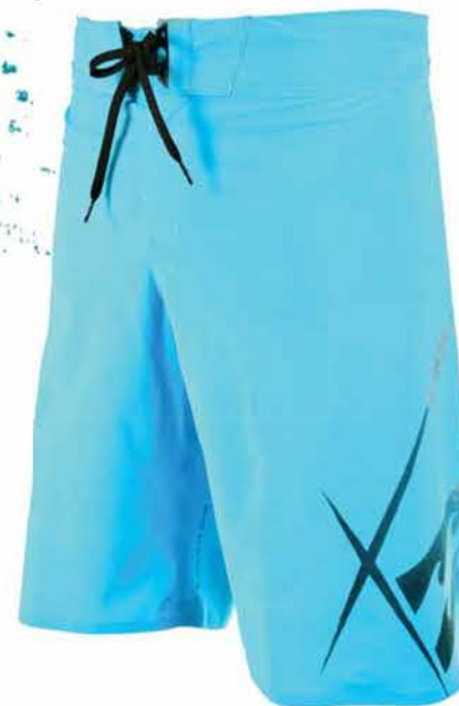
↑ You don't have to be a professional surfer to look like one with Billabong's PX1 boardshorts in ocean blue. $140. www.billabong.com.au

This limited-edition Pop table by Australian furniture designer Brodie Neill is supported by a single entwined carbon fibre "ribbon" that seems to orbit its mother ship. The look is future-shock and the finish electric blue. $33,000 from The Apartment gallery, London. www.theapartment.uk.com